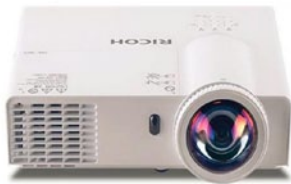
Ricoh PJ K360 Short-Throw Projector

CETRIX ActivePlane is an advanced interactive whiteboard solution that is responsive, durable, lightweight, simple to install and operate, and affordable enough for every classroom to benefit from its rich feature set for creating an interactive learning environment.